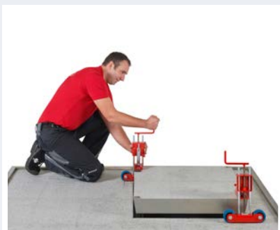
2 Simply operate the crank and the manhole cover will be lifted.